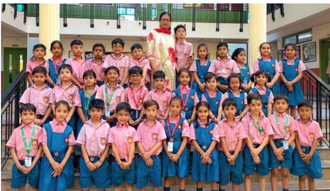
Class – II-A