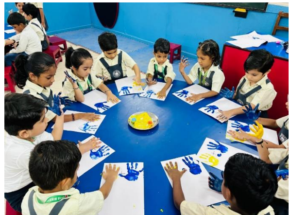
Tiny hands produce magic