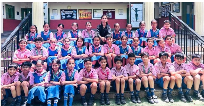
Class – V-A