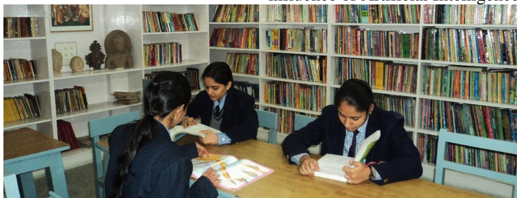
Reading leads people to build lives of meaning and purpose