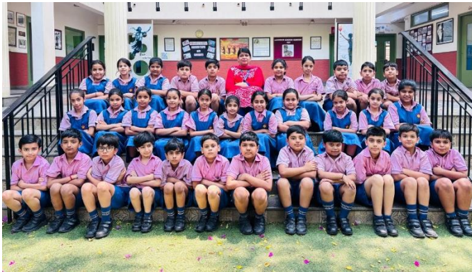
Class – IV-A