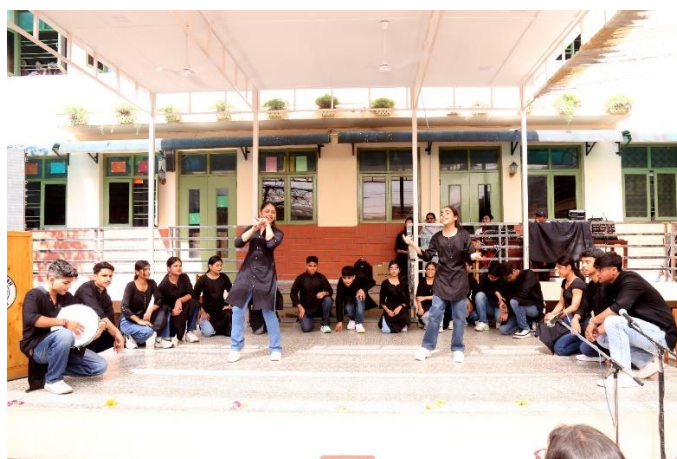
A Nukkad Natak highlighting the growing influence of Artificial Intelligence