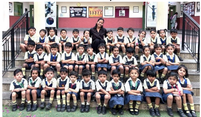
Prep - B