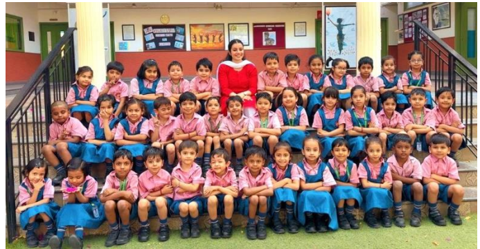
Class – I-B