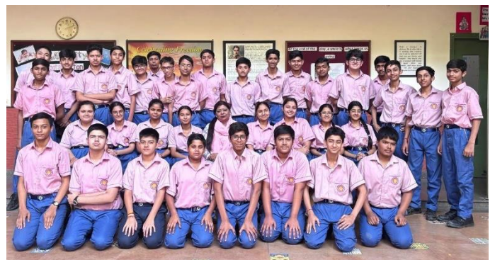
Class – X-B