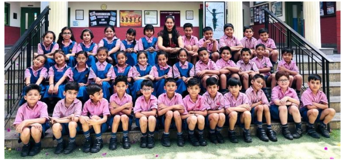
Class – III-B