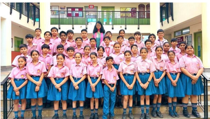
Class – VI-A