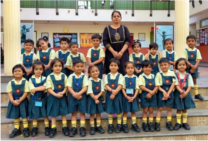
Nursery – A