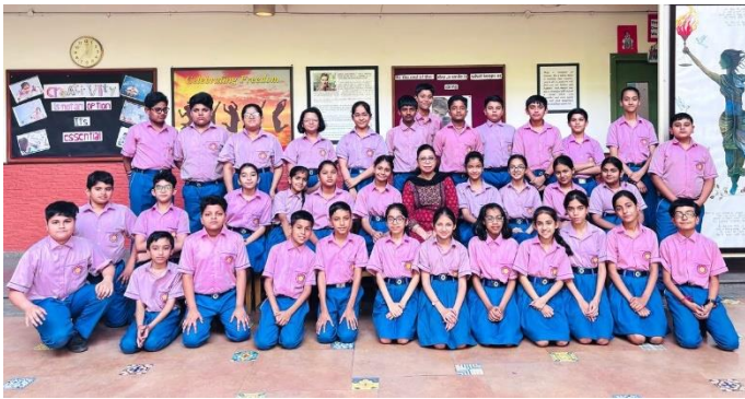
Class – VII-A