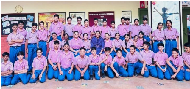
Class – VIII-A