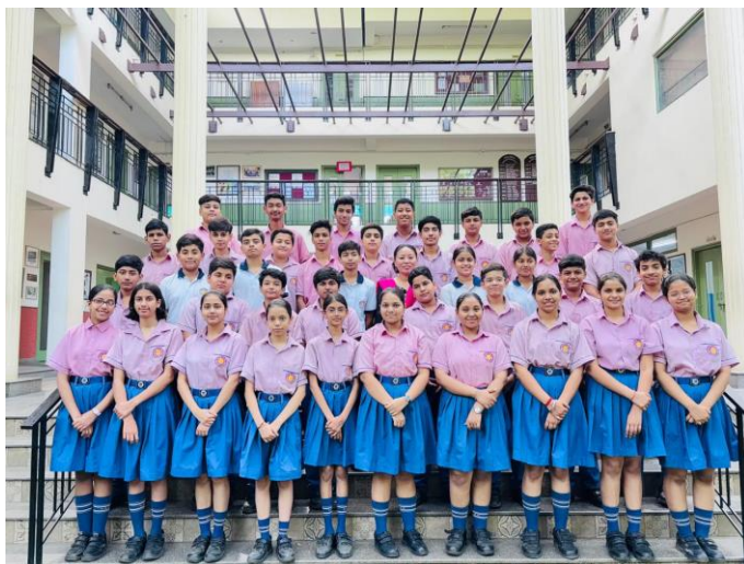
Class – IX-A