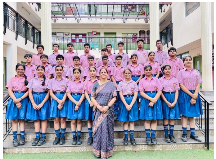
Class – IX-B