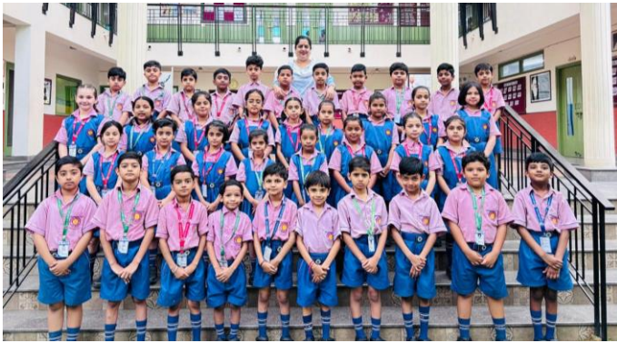
Class – III-A