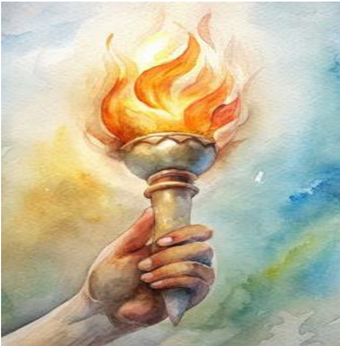
“Tu Zinda Hai” – symbolizing THE SPIRIT OF FREEDOM

NEWSLETTER OF VIDYA NIKETAN SENIOR SECONDARY SCHOOL, SAKET, NEW DELHI