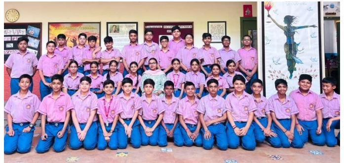
Class – VIII-B