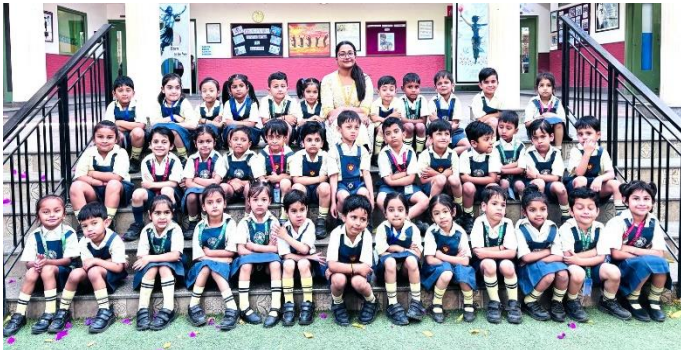
Prep – A