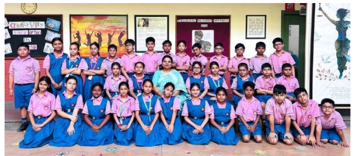
Class – V-B