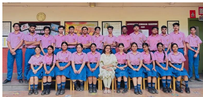
Class – XII-B