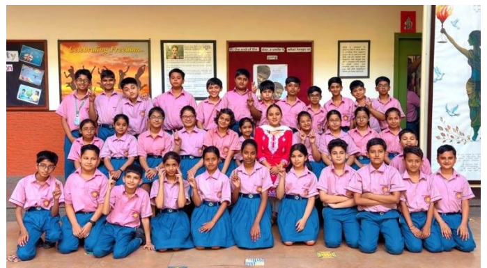
Class – VI-B