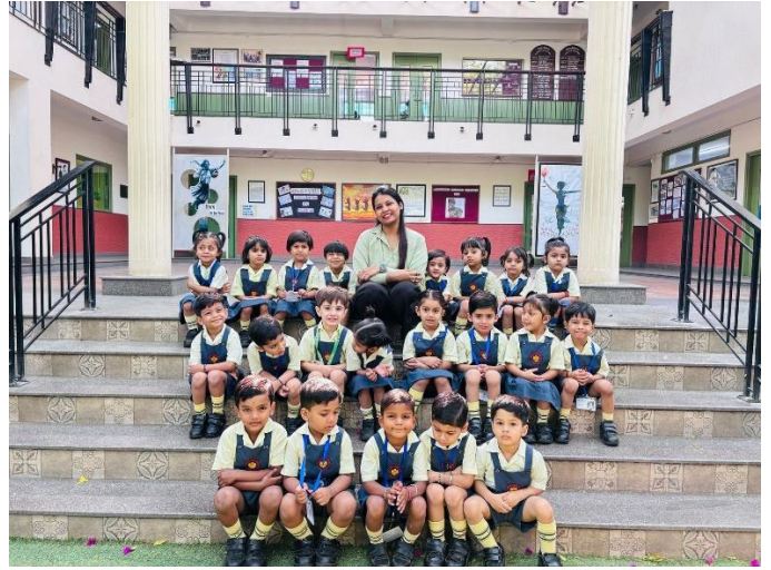
Nursery - A