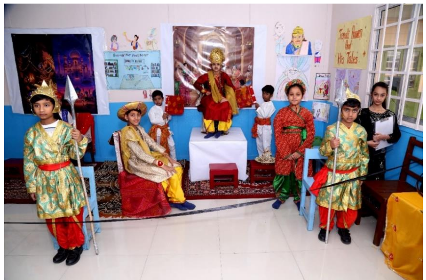
The story of Akbar and Birbal depicted by children of class II and VI