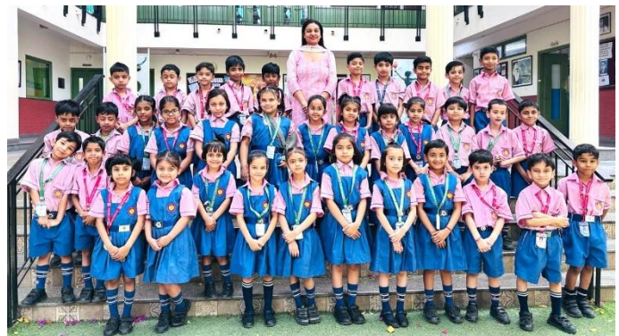
Class – II-B