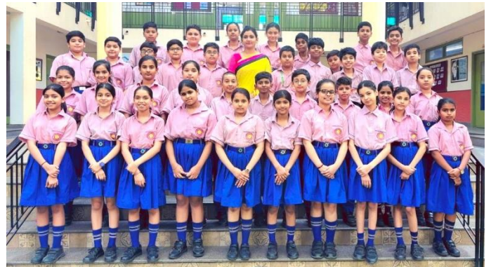
Class – VII-B