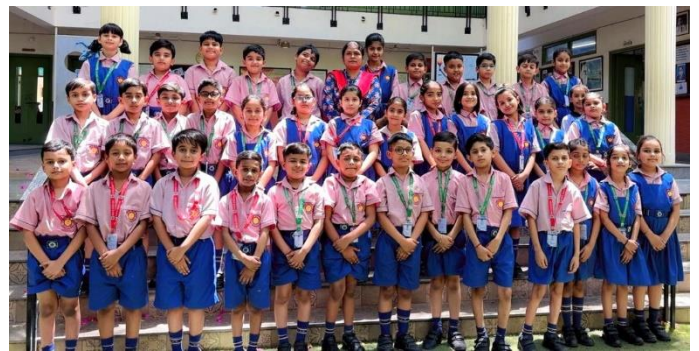
Class – IV-B