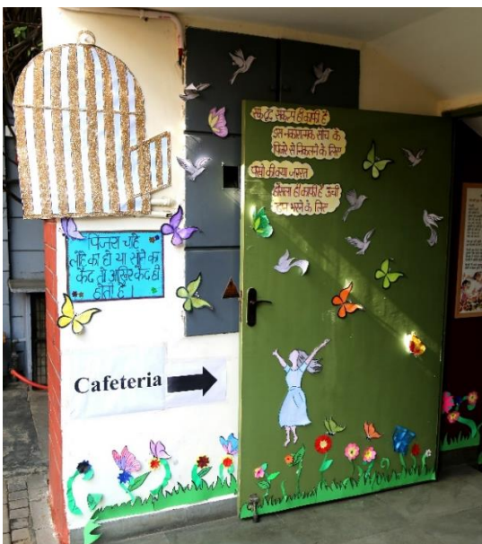
पिंजरा चाहे लोहे का हो या सोने का, कैद तो आखिर कैद ही होती है।