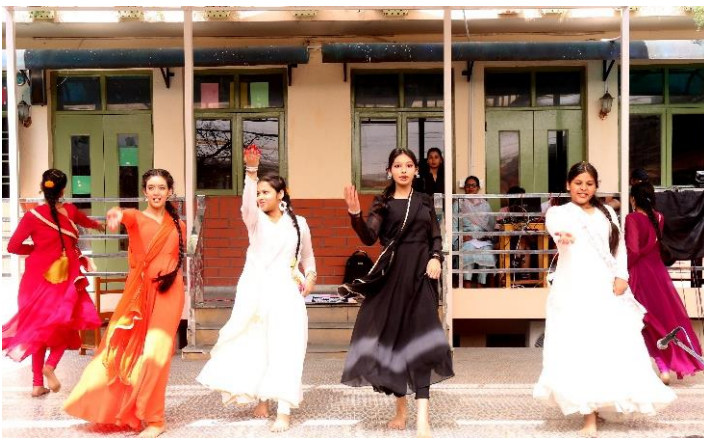
Our graceful dancers are sending forth a Powerful message on freedom