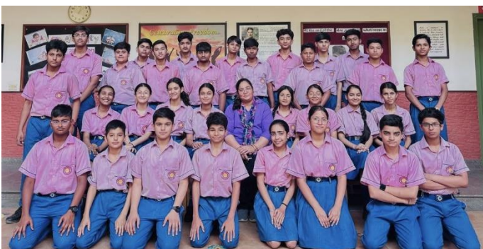
Class – X-A