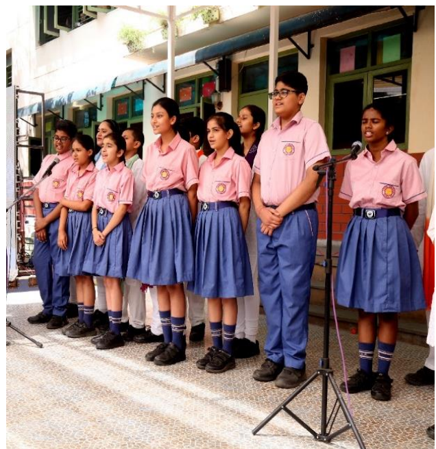
Honouring parents with the song - “You raised me up”