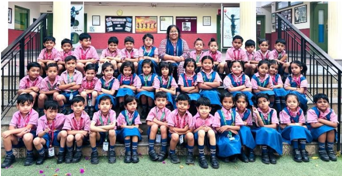
Class – I-A